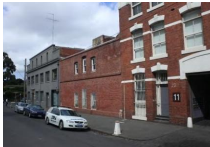
TB Guest Building in Anderson Street, West Melbourne.

Tuesday 24 March at 7.30pm, Hotham Room, North Melbourne Library.