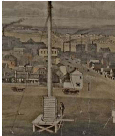
Corner of King and La Trobe Streets from Flagstaff Hill Observatory 1858.